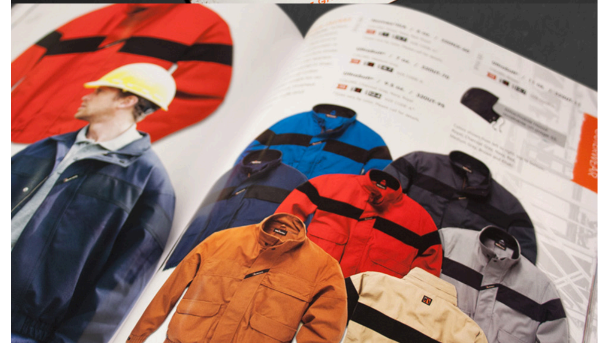
WORKRITE UNIFORM COMPANY | CATALOG DESIGN