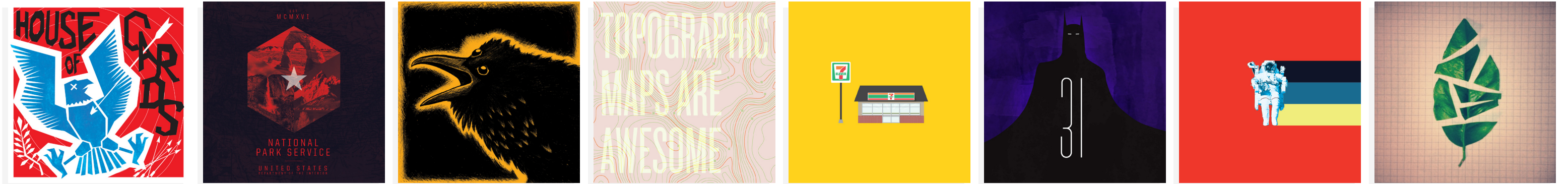
PROJECT 52 SUBMISSIONS