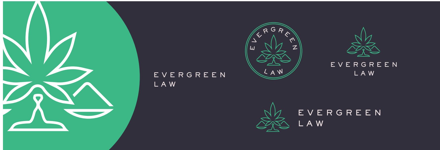
EVERGREEN LAW | LOGO DESIGN